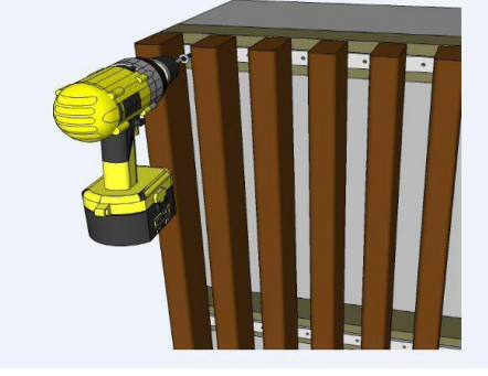
Fixed the fence module

•Install the fence module to the sub-beam with Hexagon flange head drilling screws.